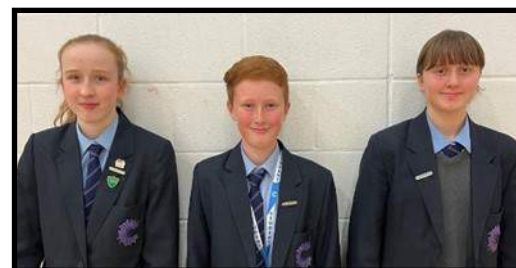
Year 9 Sports Council