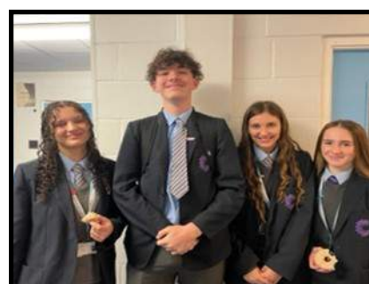
Year 11 Sports Council

Students from each year group had the opportunity to apply to become a Sports Council Ambassador to represent their year group and the school within sporting opportunities. There were over 60 applications from various year groups and the following students were chosen: