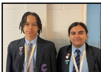
Year 10 Sports Council