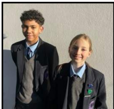
Year 7 Sports Council