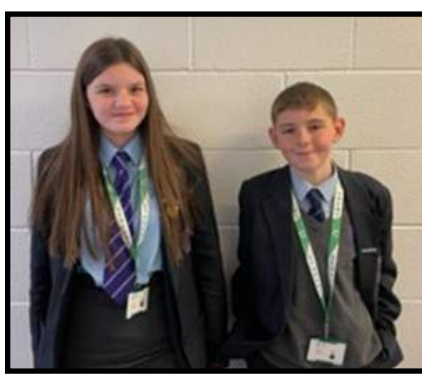
Year 8 Sports Council